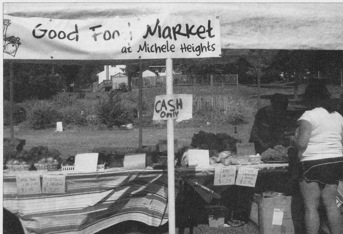
Shopping at the Good Food Market at Michele Heights.